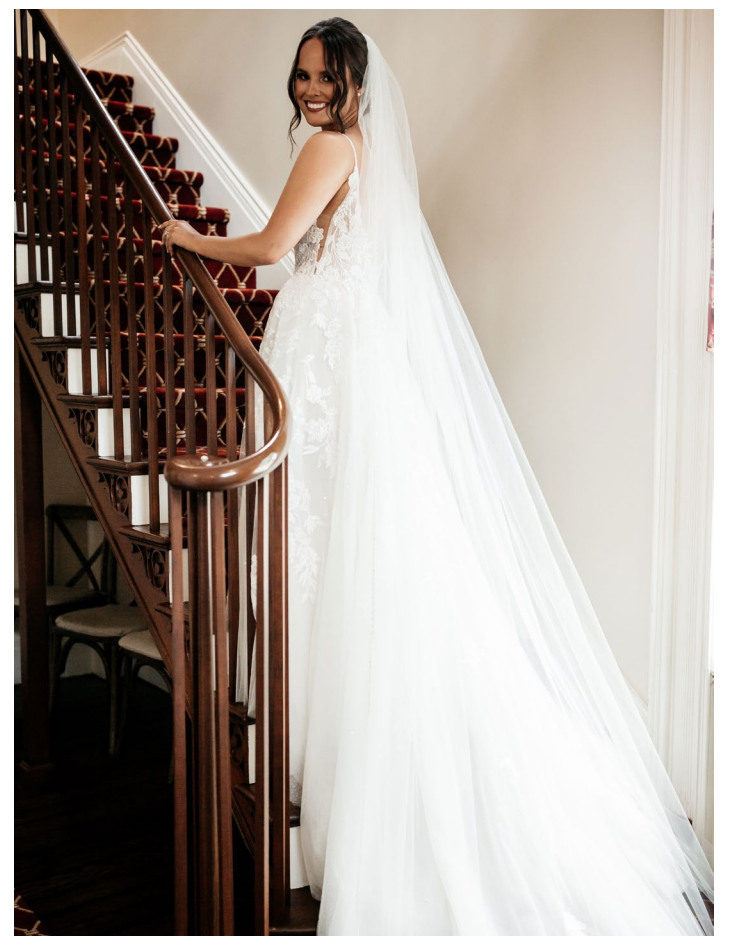
*Couple must comply with Ohio law and present a Marriage License. Please contact us to inquire about our baby, bridal, wedding, anniversary and vow renewal packages.

This package is an intimate ceremony for the Bride and Groom and up to 18 guests. This package includes a Welcome Tray of treats from the Chef, special dinner for the Bride and Groom and their guests. Additional dinner or reception charges will apply. Additional charges will apply if more than 18 guests.